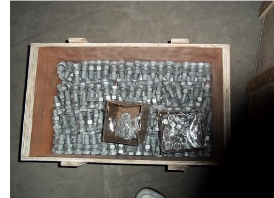
11. Fastener Check