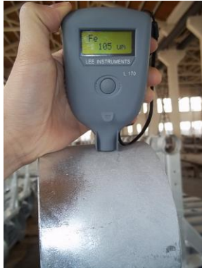
8. Zinc Layer Thickness Measurement