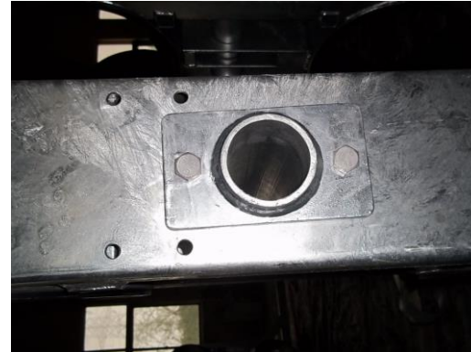
10. Assembly Test