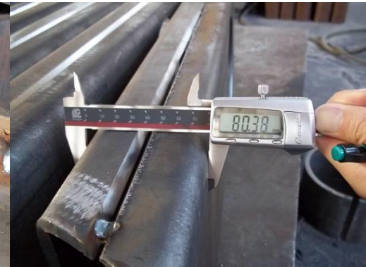
5. Dimension Check Frequently Sampling Inspection