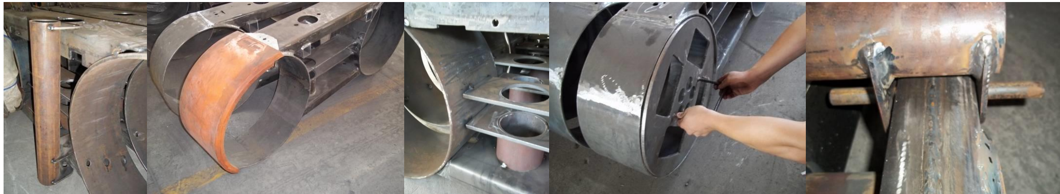
7. Assembly Check