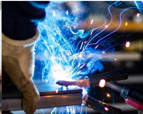
4. Welding Welding Experience 10yrs +