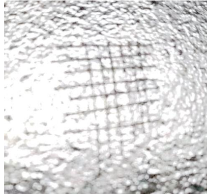
9. Zinc Layer Adhesiveness Test